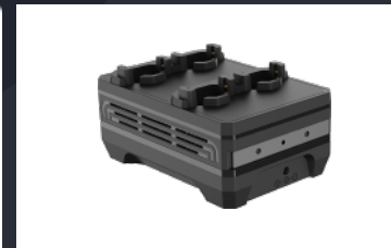
4-slot Terminal Charger