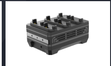
6-slot Battery Charger