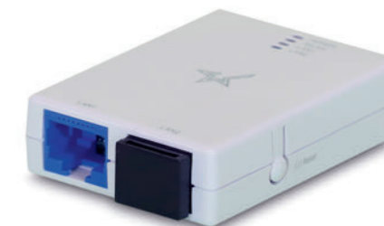
MCW10 Wireless LAN Module

The new TSP100IV from Star brings a unique new design for a truly revolutionary product. The quality and reliability of the popular TSP100 series has been fused with enhanced connectivity and specialist printing features for the very latest in point of sale and omni-channel commerce. For the ever-changing retail environment, the TSP100IV has every angle covered!