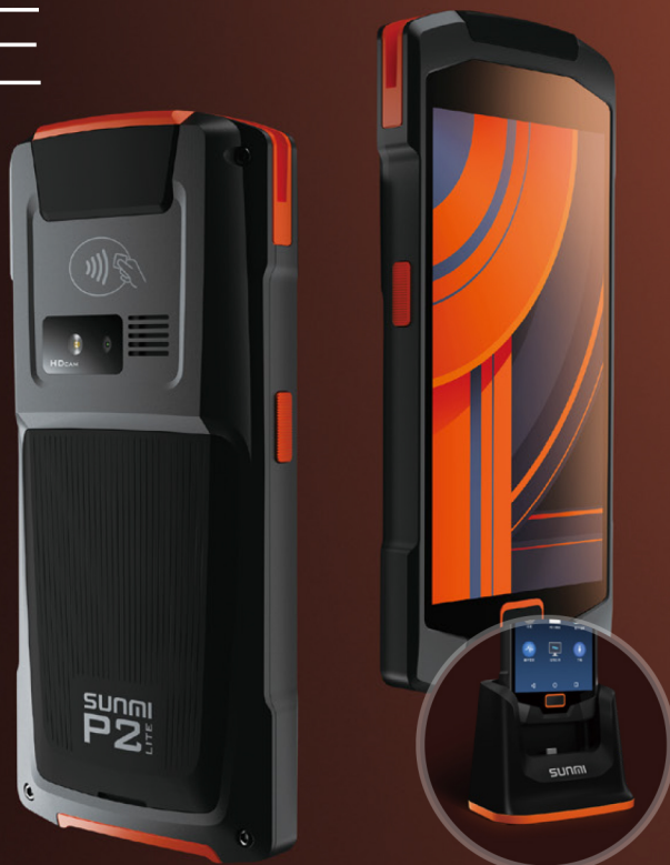
Optional single stand charger