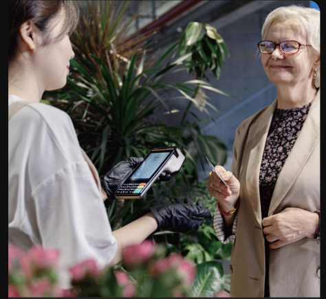
Designed for the Visually Impaired

*The above scenarios apply to P3/P3K/P3H.