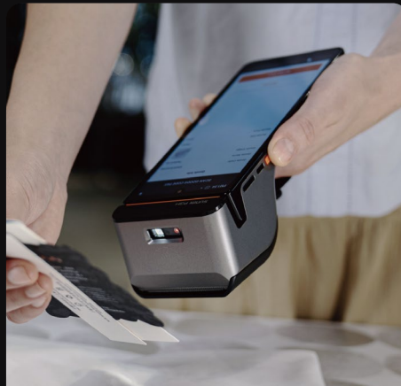
Retail Inventory Counting & Checkout