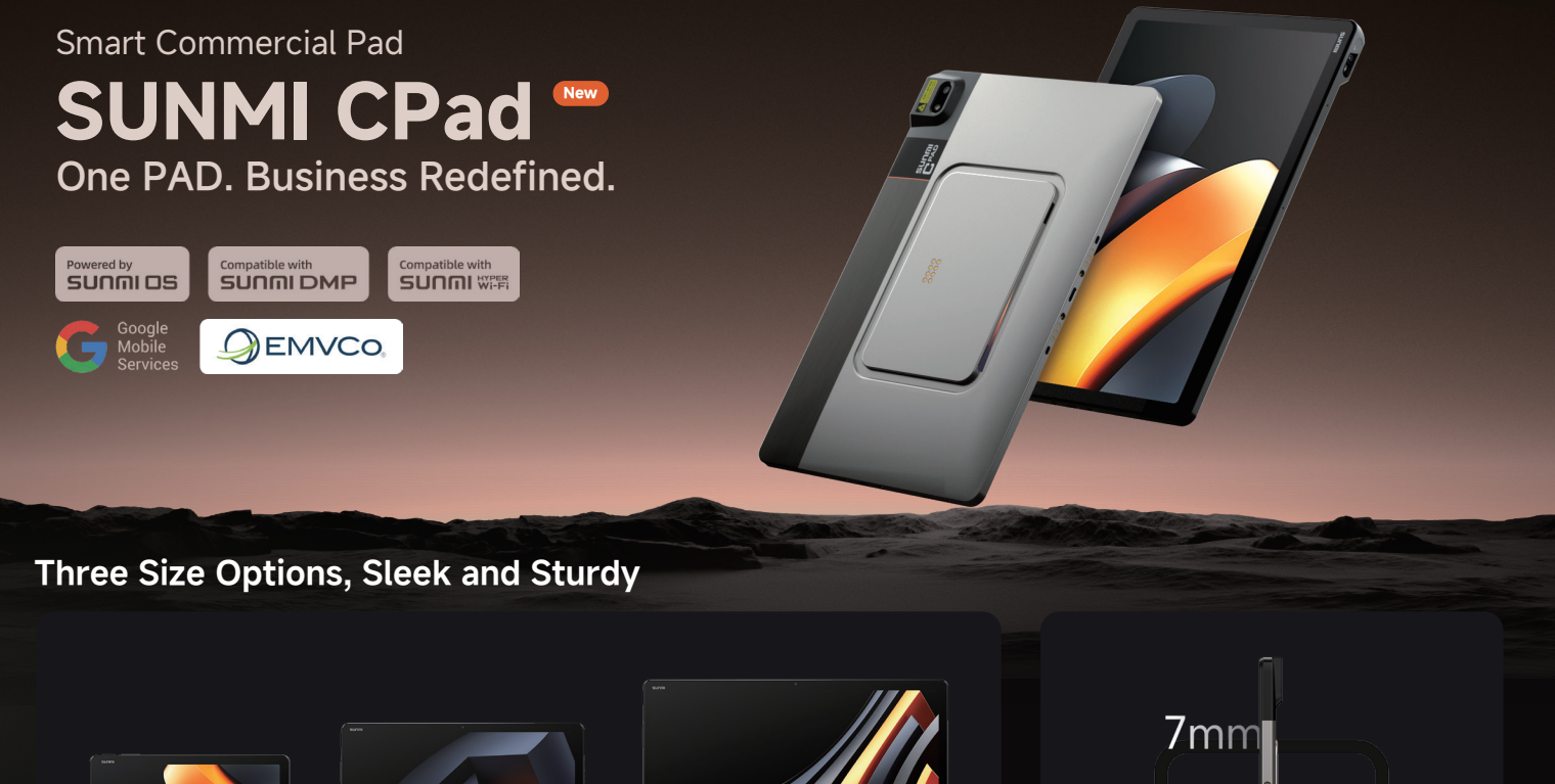
8.7" Easily Portable