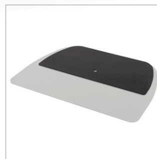
Includes cover plate to hide grab handles once installed

Visit www.resay.co.uk or call 01344 304 143 for more information.