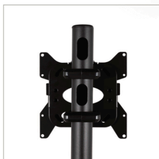
Integrated cable management for tidy install