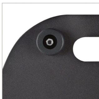
Supplied with non-marking rubber feet for increased stability