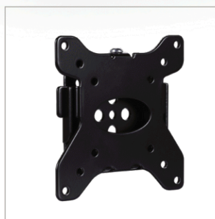
Small flat screen interface suitable for screens with VESA Fixings up to 100 x 100