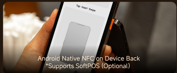
Android Native NFC on Device Back *Supports SoftPOS (Optional)